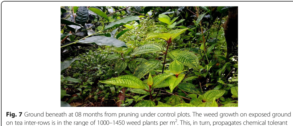
harmful weeds for tea

The use of core environmental measures such as energy, water or waste is not relevant to this study. Hence, the authors had to search for supplemental measures. The environmental perspective of the eco-innovation was therefore assessed through physical EMA information by using the canopy area and ground cover (refer Table 2). Instead of quantifying